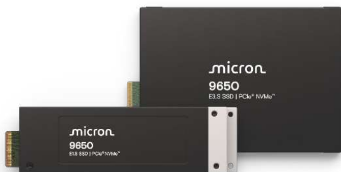
Micron 9650 NVMe SSD: E1.S 9.5mm and E3.S 1T

Solutions like the Micron 9650 help deliver the data for a performant, sustainable, scalable infrastructure.